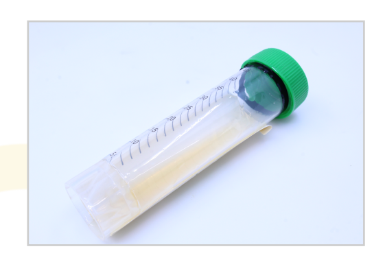
Unit: 28.35 grams | Units Per Package:1

Analyzed via AAM-001 using Agilent 1220 HPLC-DAD. Limits are based on CO 6 CCR 1010-21. Sample was analyzed as received. Deviations from SOP: None.